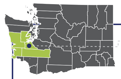
FIGURE 1: The PacMtn Workforce Development Region

The Pacific Mountain Workforce Region (PacMtn) is one of the 12