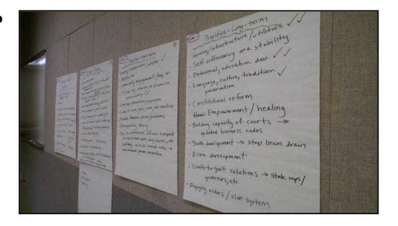
Participant feedback from Day One on Tribal Administration priorities