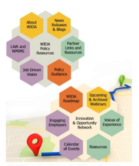
The WIOA website and the Innovation & Opportunity Network are working in concert to provide you with the most up-to-date information concerning WIOA. This graphic shows what can be found on the two websites and we encourage you to utilize them as a cross-reference tool.

This site also provides links to the WIOA-specific web resources maintained by all the Federal partners as well as the "Dear Colleague" letters which set forth the agencies' perspectives and insights for their grantees, stakeholders, constituencies and communities.